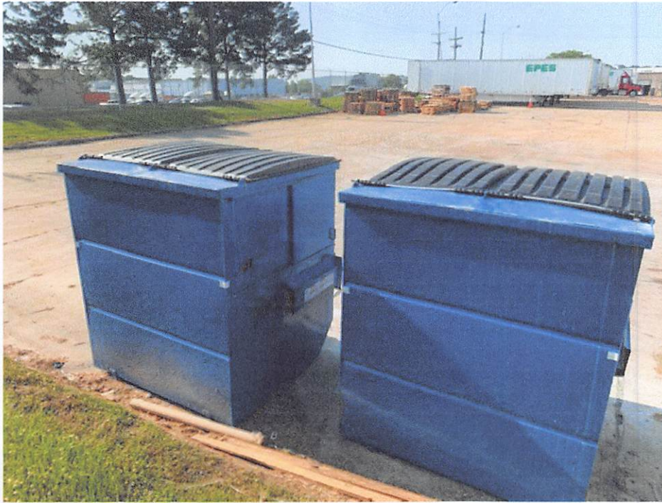
Figure 3. Dumpsters with Lids Installed