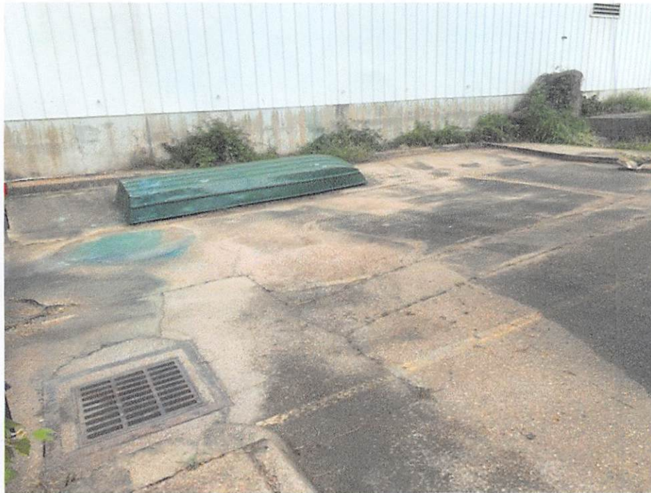
Figure 1. Old Location for Wash Water Storage Tank